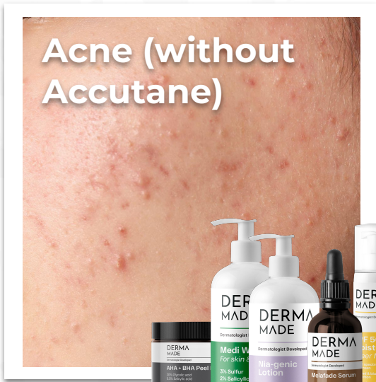
Acne (without Accutane)

Note: Add prescription steroids if there is itching as needed.